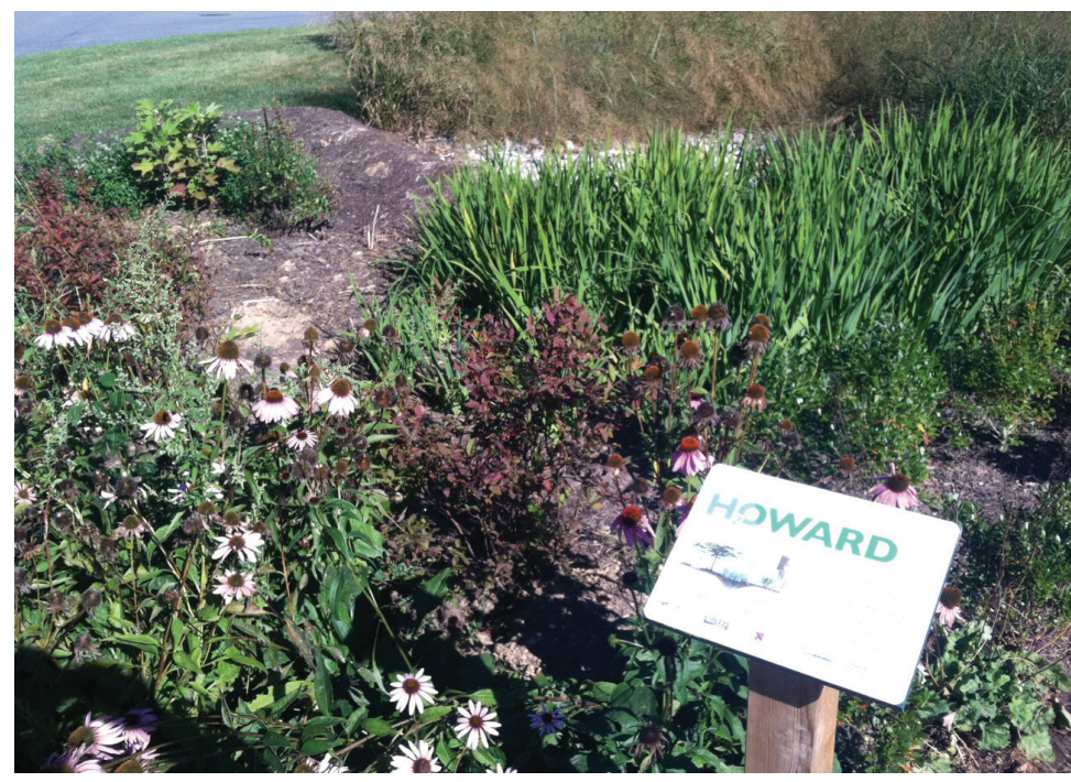
Rain garden at Franciscan Friars

Rain gardens are gardens filled with native plants and absorbent soil that are shaped to collect and filter water when it rains. Rain gardens are not only beautiful and attractive to local wildlife, but can also help solve drainage and pooling problems in your yard.